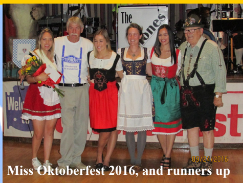
Miss Oktoberfest 2016, and runners up 09/24/2016

Tapping of the Keg German Draught Beer Delicious German Food Miss Oktoberfest Contest Live Music by The Haus Band 3-6pm The Nu-Tones Band 7:30 - midnight