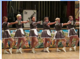
Back by popular demand The Narragonia Dancers

FOR INFORMATION AND TICKET SALES CALL THE GERMANIA CLUB at 905-549-0513